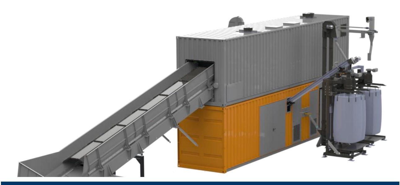
Figure: MTB Drycell box provides shredding and metal separation of materials

MTB has developed significant expertise in the pretreatment of production battery anode scrap. The Drycell box pretreatment process achieves efficient separation of battery materials.