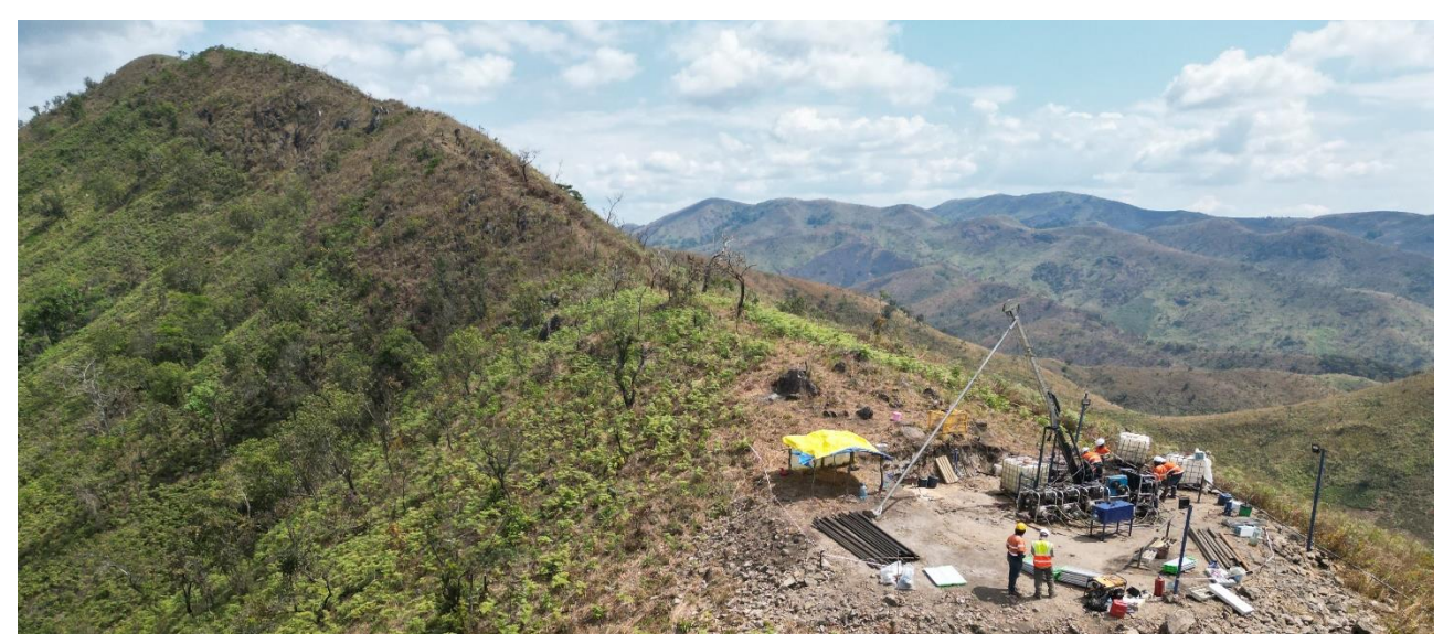
Figure 2 : Epanko Western Zone Expansion Drilling