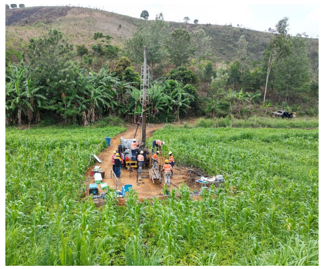
Figure 1 : Geotechnical Drilling at the Site of the Epanko Tailings Storage Facility Retaining Wall

The geotechnical engineering activities included a series of test pits and drill holes focused around the TSF and its retaining structure. Global TSF regulations have changed since the 2017 BFS, therefore the additional data will ensure the design meets these new standards.