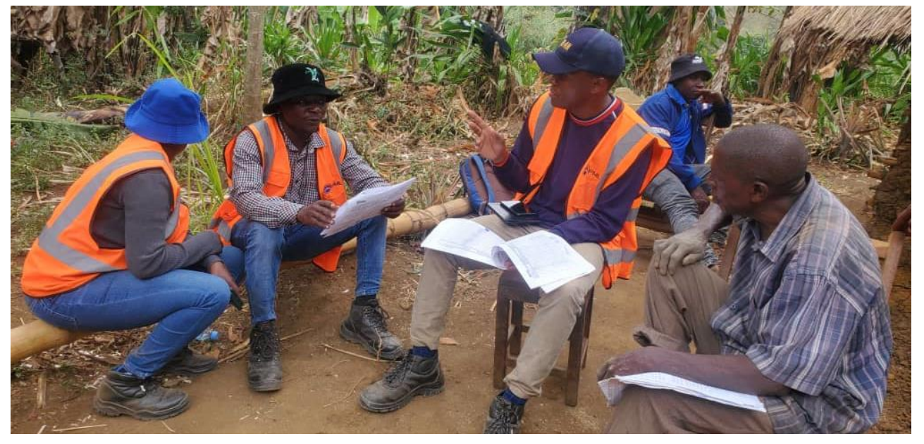
Figure 4 : Consulting with the Epanko community during land and socio-economic surveys at Epanko

The results from this program are being compiled into an updated valuation report that will be submitted for the review and approval by the Chief Valuer from the Ministry of Lands, Housing and Human Settlements Development, to form the basis of the updated RAP compensation arrangements. The engagement and surveying program involved consultation with stakeholders at various government levels, establishment of a Resettlement Working Group (RWG), focus group and individual meetings, and was undertaken through a joint team of leading international and Tanzanian resettlement consultants. The process was undertaken consistent with Tanzanian legislative requirements, as well as international good practice as per the International Finance Corporation's (IFC) Performance Standards and resettlement guidelines.