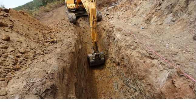
Figure 5 : Excavation of the Western Zone Bulk Sample